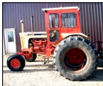
'67 Case 1030 Comfort King Turbo Diesel 3 pt dual hyd. 540 PTO 18.4x34 band duals ser# 8318198 Very straight!