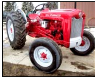
'59 Ford 601 Workmaster Ser# 70975. Dead mate to the other one but without front wheel assist. Cherry! 19.9x28 rears 7.50 16 frnts