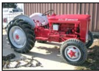
Very Rare '58 Ford 601 Workmaster w/front wheel assist Beautiful. 12.4x28 rears 7.00x16 fronts. Chains available Ser# 18263