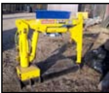
Fruehoff Heavy duty 2 ton 12v elec/hydr cherry picker

MORE IMPLEMENTS Snowy 80" snowplow, Danuster MD-5 post driver PTO 3pt, steel tracks for Bobcat, Mott Interstator 7-1/2" flail mower, 3 1/2 yd concrete hoppers, county ditch sprayer, John Deere 428 40" PTO dr elevator, 1000 gal propane tank cleaned & tested, Ford 3-14" plow 3pt, Oliver 1 btm plow, single axle trlr w/bunks, Minnesota Super 6 hay wagon, spring tooth drag sections, John Deere 2-12" drw bar plow, Hesston 250 gravity box, REA utility pole trlr, pair 15x34 band duals, pallet forks, steer tires 10Rx22.5, John Deere 3-14" 3pt plow, 9' spring tooth cultivator, John Deere new counter wgt box, Erskine mfg snow blower 3pt PTO, 3 pt landscaping blade like new, 200 gal poly tank, hvy duty 2 whl tilt bed 10' flatted trlr,