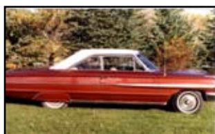
Outstanding '64 Ford Galaxy 500 Maroon and White 79,000 act miles. 289 auto. Nebraska car, no rust, parade ready.