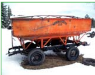
250 Minnesota gravity box