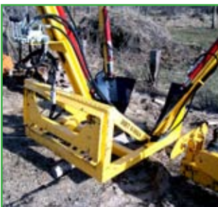
Dirt Works 30" 3 blade tree spade Bobcat mount hyd. Like brand new.

MORE IMPLEMENTS Snowy 80" snowplow, Danuster MD-5 post driver PTO 3pt, steel tracks for Bobcat, Mott Interstator 7-1/2" flail mower, 3 1/2 yd concrete hoppers, county ditch sprayer, John Deere 428 40" PTO dr elevator, 1000 gal propane tank cleaned & tested, Ford 3-14" plow 3pt, Oliver 1 btm plow, single axle trlr w/bunks, Minnesota Super 6 hay wagon, spring tooth drag sections, John Deere 2-12" drw bar plow, Hesston 250 gravity box, REA utility pole trlr, pair 15x34 band duals, pallet forks, steer tires 10Rx22.5, John Deere 3-14" 3pt plow, 9' spring tooth cultivator, John Deere new counter wgt box, Erskine mfg snow blower 3pt PTO, 3 pt landscaping blade like new, 200 gal poly tank, hvy duty 2 whl tilt bed 10' flatted trlr,