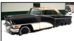
'55 Packard Panama Clipper 2 dr hdtv Very classy restorable