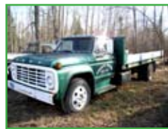
'73 Ford 2 1/2 ton w/ tilt 390 4+2 runs good

A Good Lunch will be served by Carol Vicory's "Cruisin' Cafe"