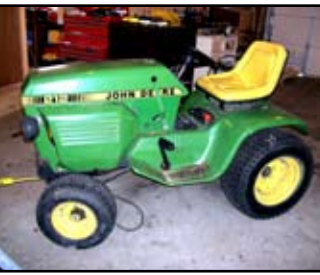
John Deere 225 garden tractor. John Deere implements for garden tractor, Snow blower, mower deck, rear tine tiller