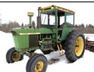
John Deere 4010 w/ 4020 upgrade. 3 pt PTO hydrlc's 18.4x34 rears 10.00x16 frnts ser# 16745