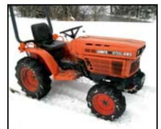
Kubota B7200 4wd 3cyl Diesel 16hp w/rops 3pt 540-820 PTO 454 actual hours.